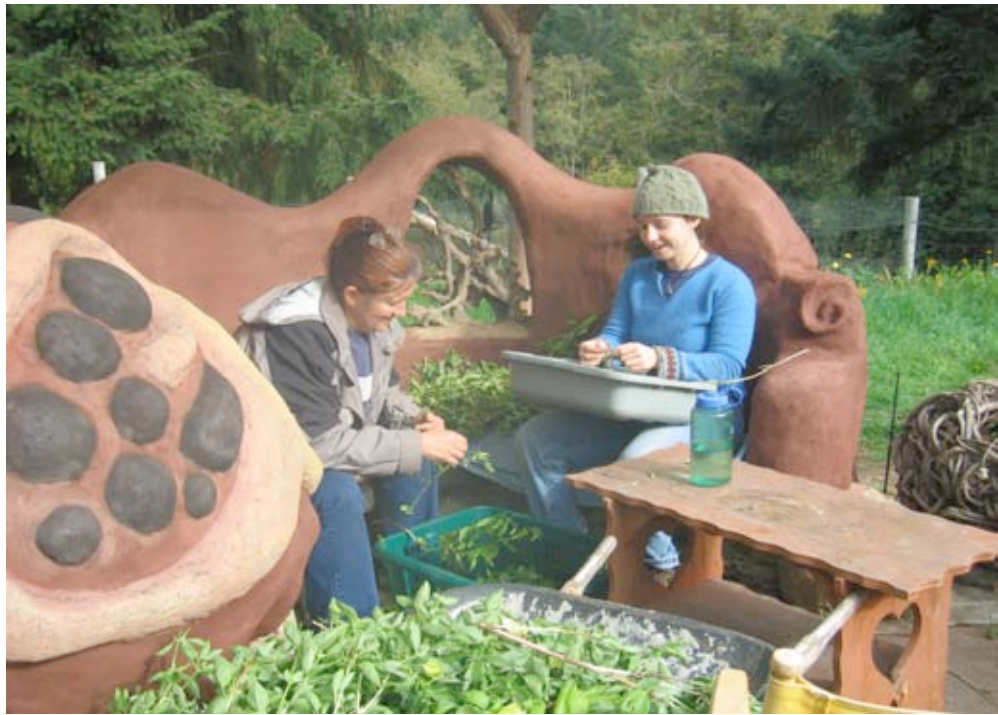
Sustainable food, Natural Building