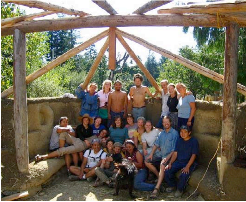
TOPIA: The Sustainable Learning Institute, Skillbuilder Programs

skills and knowledge related to the areas listed above and aimed at enhancing the well-being of all concerned.