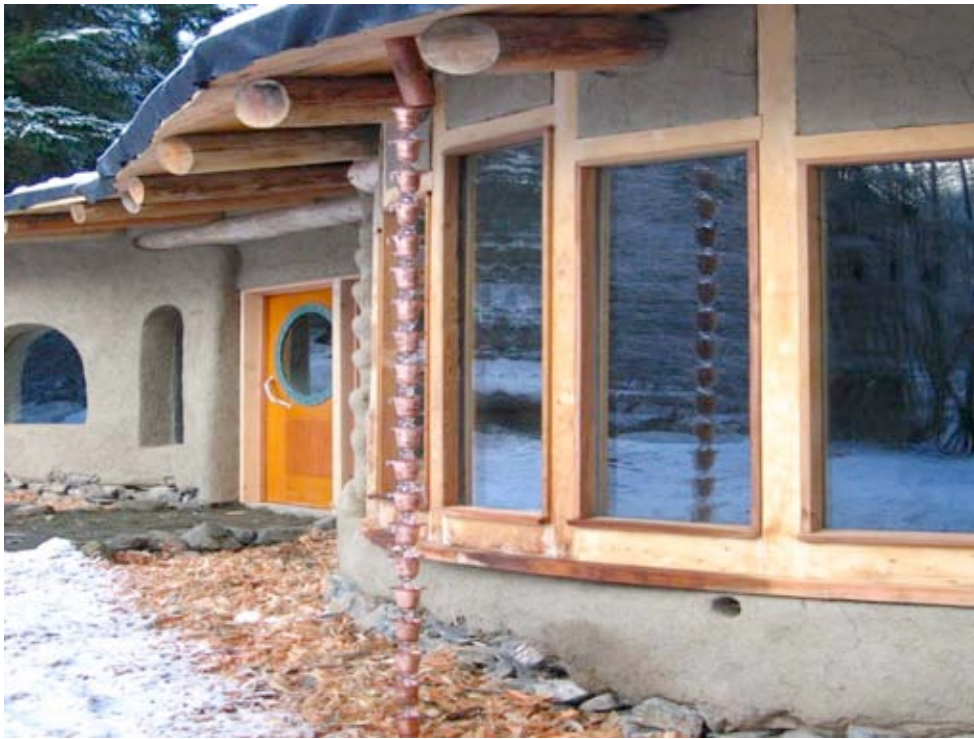
Climate Change Demonstration Building (Healing Sanctuary)

Phase VII (July 2007 - present) begins with the creation of a new ownership entity (developed with the assistance of the FOG project). In July 2007, we established O.U.R. Ecovillage Cooperative, incorporated with five membership classes. The co-operative was created for the purpose of providing a legal model for the collective ownership of the land and to provide a governance structure that will bring together all the earlier established organizations at O.U.R. and all interested parties. The cooperative has begun to implement this plan through the creation of a business plan in order to secure financing for the purchase and further development of the property.