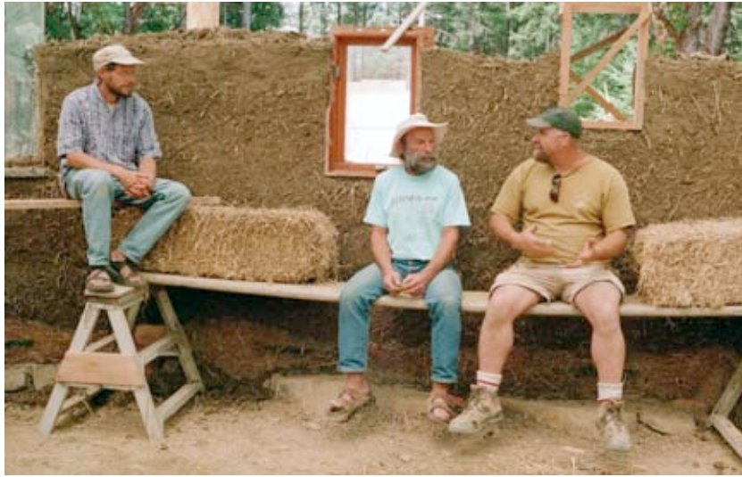
Discussions on Straw Bale....